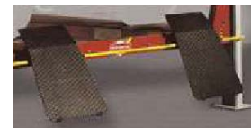
P/N 4370500 EXIT RAMP SET