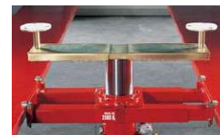
P/N 4249800 + 4249900 PISTON JACK BEAM 2t