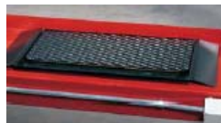
P/N 4661600 SLIDING REAR PLATFORMS