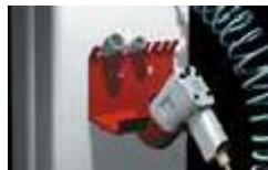
P/N 999991 TOOL SUPPORT