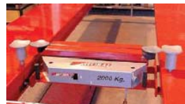
P/N 5251100 SCISSOR JACK BEAM 2t