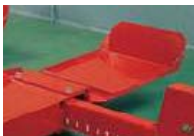
P/N 4741600 ALIGNMENT SUPPORT