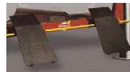
P/N 4370400 EXIT RAMP SET