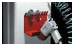
P/N 999991 TOOL SUPPORT