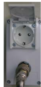
P/N 999989 AIR/ENERGY