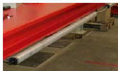
P/N 999988 PLATFORM LIGHT