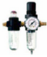
MANOMETER/LUBRICATOR WITH FILTER